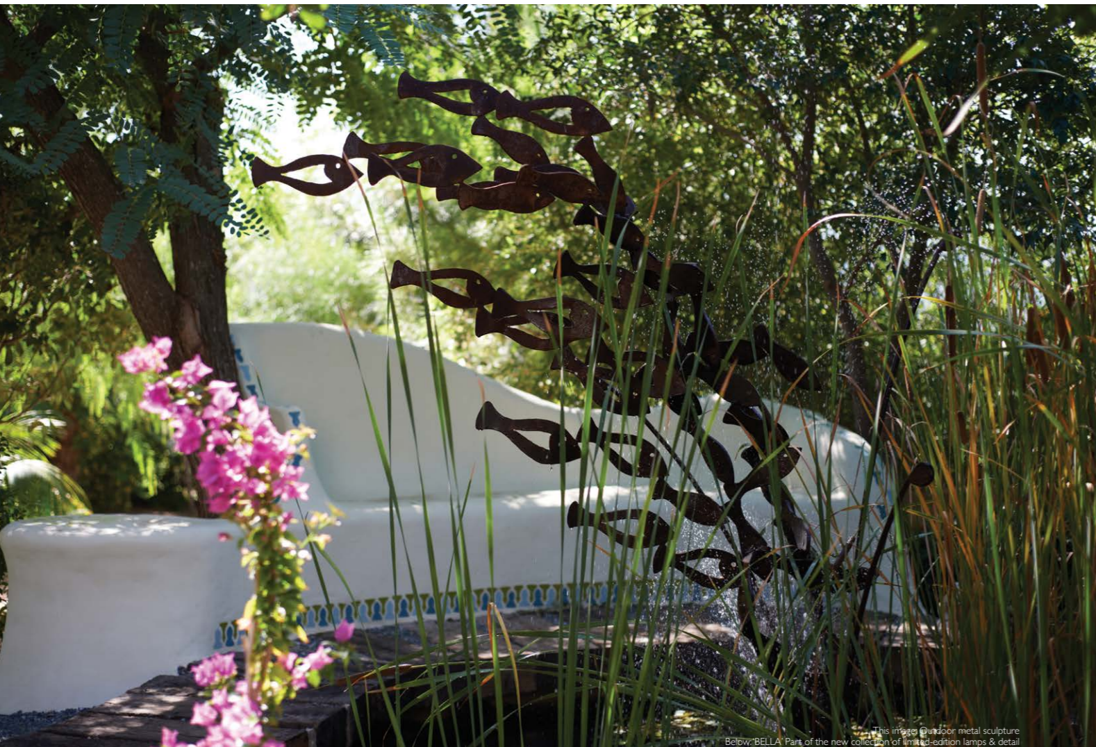
This image is an outdoor metal sculpture Below: 'BELLA' Part of the new collection of limited-edition lamps & detail